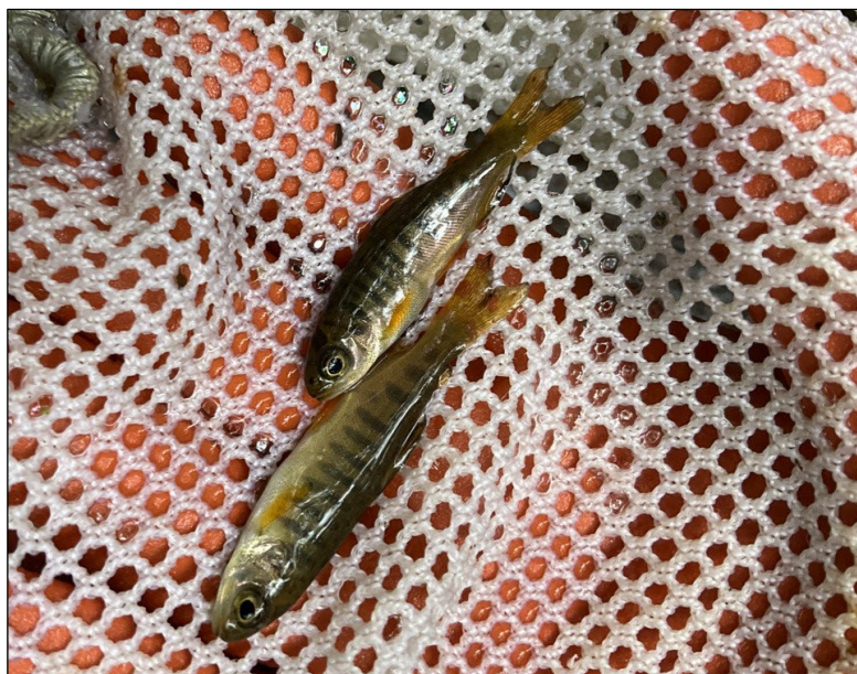
Figure 1.–Juvenile coho salmon captured at waypoint 1406.