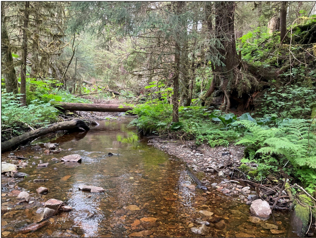
Figure 2.—Channel at waypoint 1263 facing upstream.