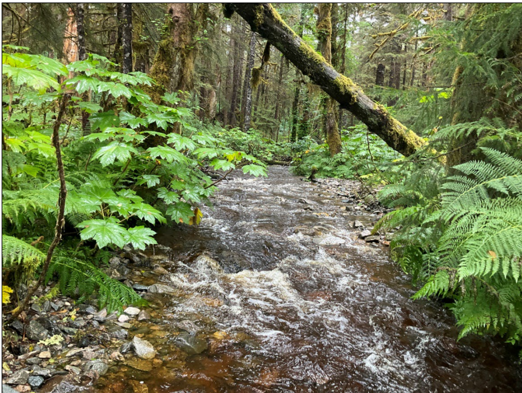
Figure 3.— Channel at waypoint 1410 facing upstream.